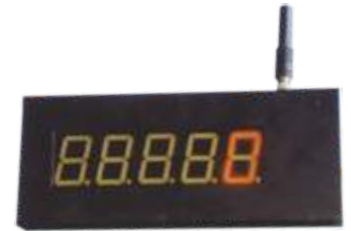
Wireless Remote Display (Option)