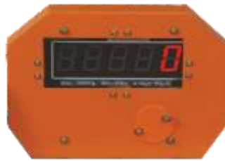
Thermal Scale with cover