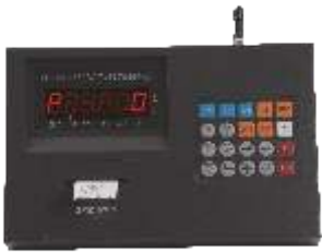
Wireless Remote Indicator with Printer (Option)