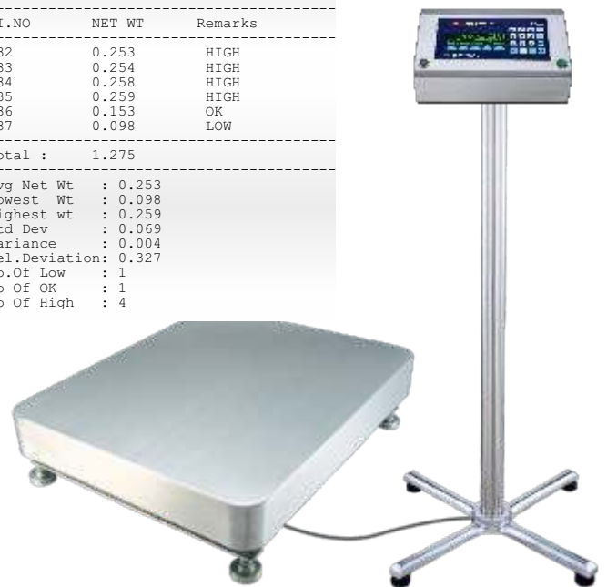
SS-304 Platform type