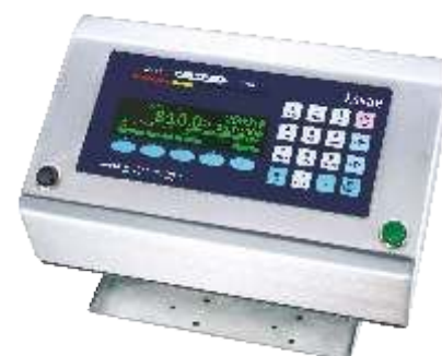
Table mount type (option)