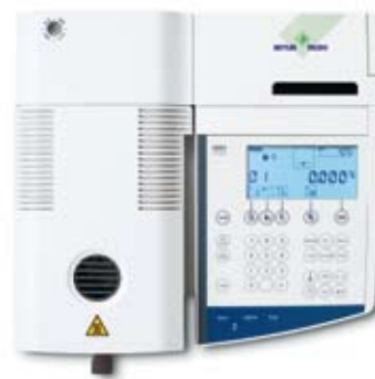
HR83 The high-end solution For highest demands and regulated areas