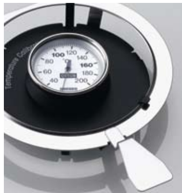
Temperature calibration at point-of-use

--- HEIZMODUL-TEST-1 --- 18.02.2008 19:03 METTLER-TOLEDO Halogen MoistureAnalyzer Type: HR83 SNR: 1113143897 SW: 1.92 Justierset ID: ..... Soll-Temperatur: 65 °C Ist-Temperatur: 64 °C Toleranz: +/- 3 °C Test-Ergebnis: Bestanden Test ausgeführt Unterschrift: ..... ----- ENDE -----