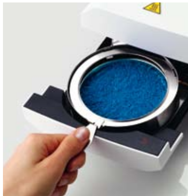
Safe sample handling Automatic drawer Easy operations