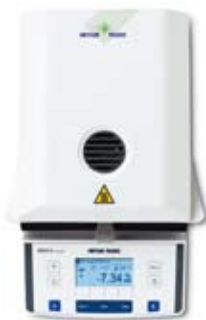
HB43-S The workhorse Ideal for measurements in production environments