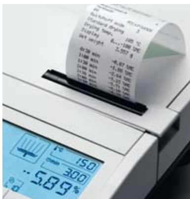
Brilliant display and GLP/GMP compliant protocols

Moisture measurements require just three operator steps: Tare the sample pan, insert the sample and press start. The measurement runs automatically and delivers reliable results within minutes.