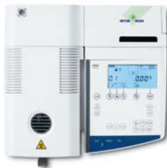
HG63 The precision instrument Perfect for routine tests in the laboratory