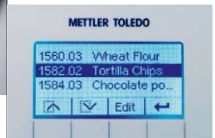
Integrated method library